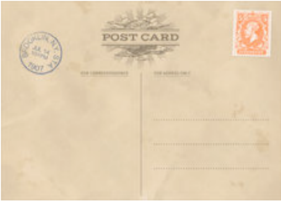
Example of pack